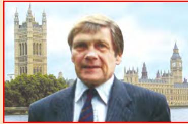
The Right Honourable The 6th Earl Grey